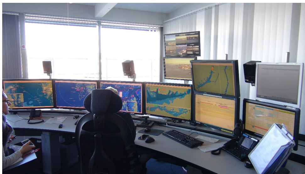
Fig. 1 Individual work station at the VTS centre

From the standpoint of providing remote assistance, VTS operations depend on the information received via sensors on computer systems, and on VHF radio voice communications. The latter include protocol reporting communications and influence essential judgements and safety decisions. The results of the fieldwork list the non-technical factors