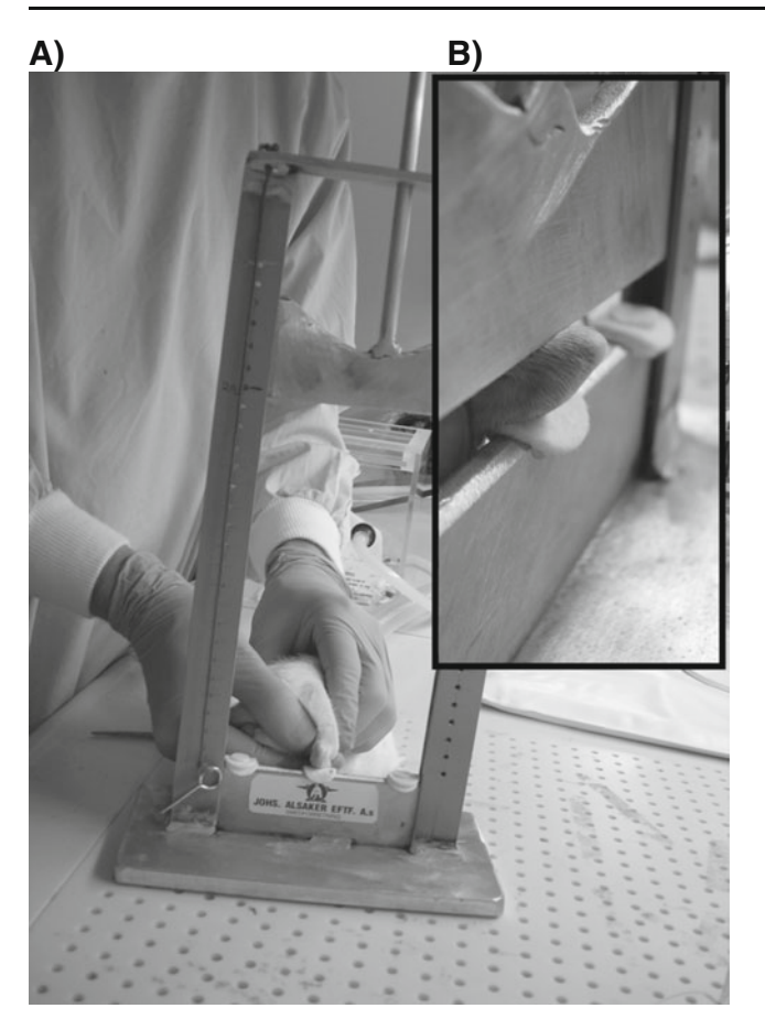
Fig. 1 a Mini guillotine with rat positioned for Achilles injury. b ( insert ) Close-up of the tendon crush location

The deformation rate was 0.25 mm/s. The load and deformation data were sampled continuously during the test.