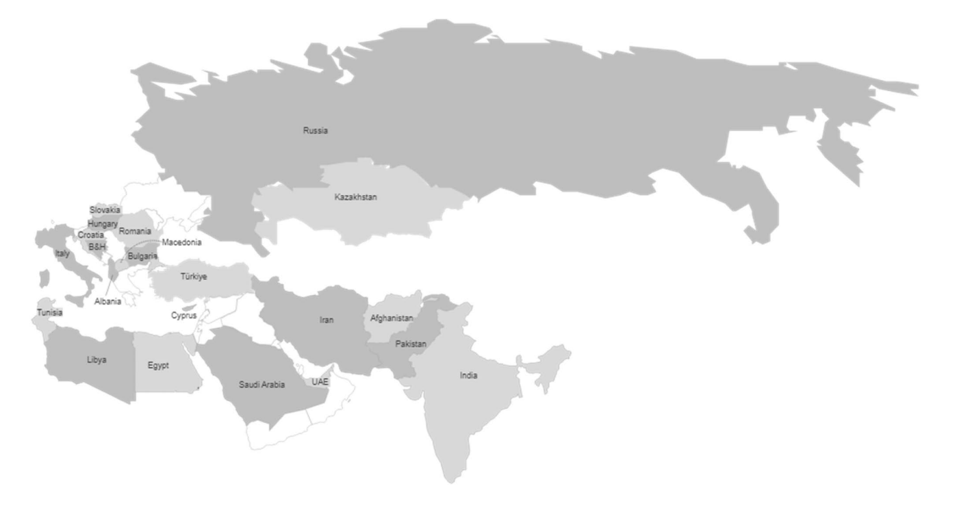
Fig. 1 The countries where participant centers are located