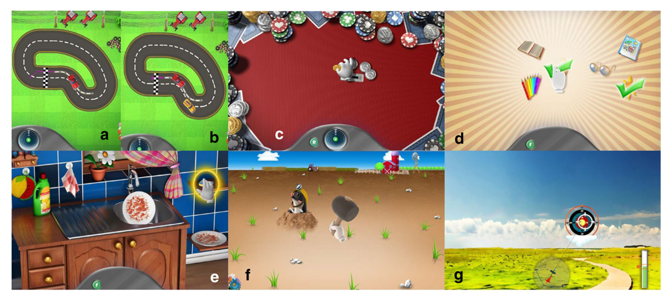
Fig. 2 Robot end-effector protocol. a Trajectories; b pursuit; c coins; d memory; e washing dishes; f moles; g archery

in neurological rehabilitation, on the couch with the patient in a prone or supine position as needed. The protocol also included active movements of the UL against the force of gravity, with the final request of isometric holding of the position for at least 6 s. According to the patient's resources, the physiotherapist, during the treatment, increased the joint range during passive mobilization and the number of repetitions, starting from a minimum of 5 repetitions up to 15 repetitions at least twice, with a rest break from 2 to 3 min. The stretching exercises were performed statically for at least three times during the session.