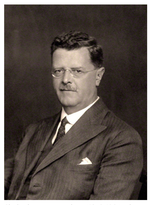
Fig. 1 Sir Gordon Morgan Holmes (1876–1965). Photo made by Stoneman W, 16 June 1933. Source: National Portrait Gallery, London. http://www.npg.org.uk/collections/search/portraitLarge/mw109878/Sir-Gordon-Morgan-Holmes