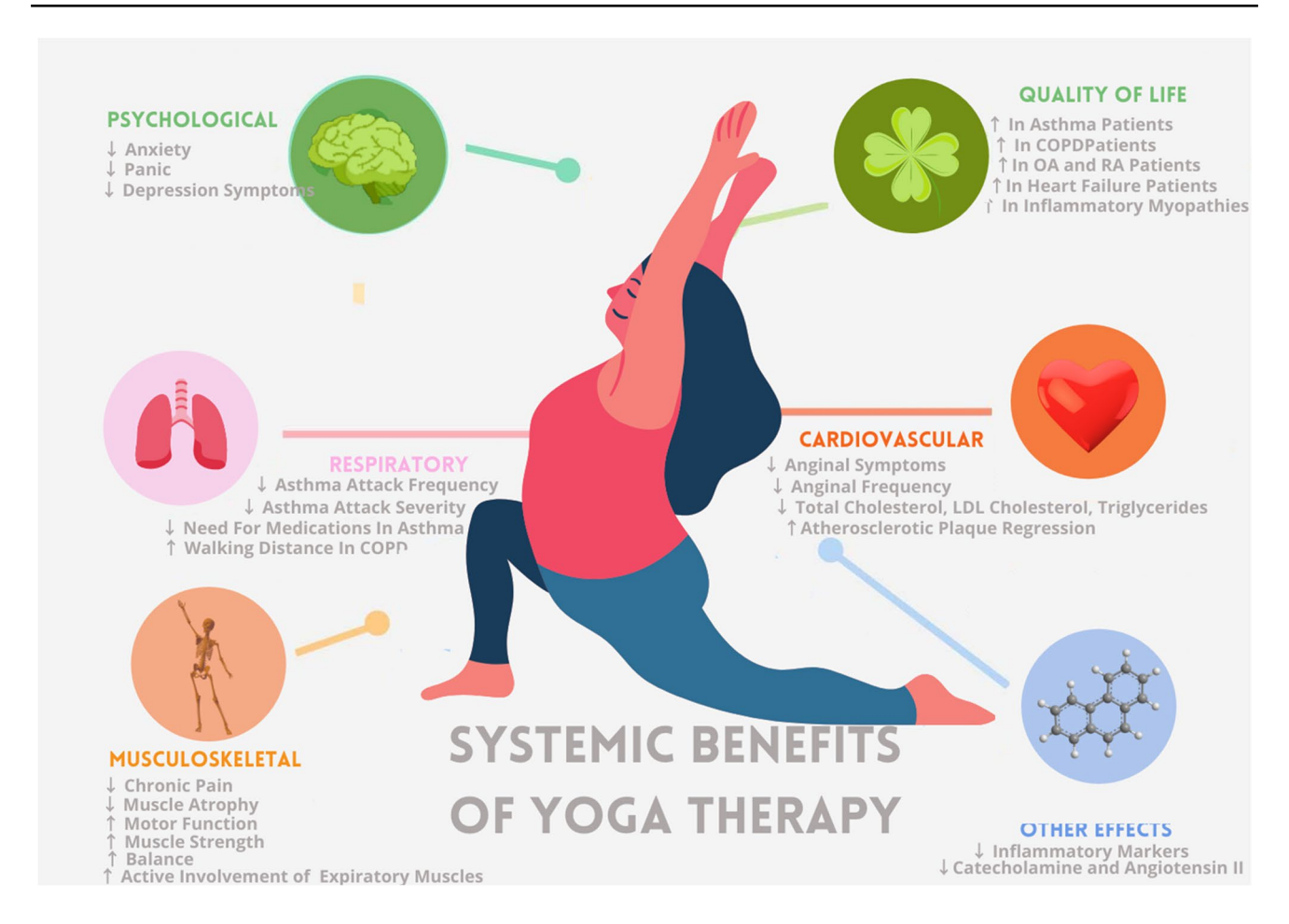
Fig. 2 An infographic depicting the positive impact of yoga therapy on the cardiovascular, respiratory, and musculoskeletal system, along with the psychological impact, and effect on patient Quality of Life (QoL) in chronic health conditions

pharmacological immunosuppression or in those in whom side effects of medication are unbearable. Yoga can therefore, be a cheap, effective and non-pharmacological adjuvant option for patients with IIM in resource poor settings. The distinct advantage of yoga in IIM lies in it being easy to practice, well tolerated and not requiring excessive in-person guidance, thus combating disability in IIM by easily maintaining routine physical activity [26]. The fear of damage or progressing symptoms resulting from exercise is a misconception, as lack of physical activity may spur muscle atrophy in myopathies. Furthermore, studies show that muscle weakness may persist even after long-term treatment with pharmacological therapeutic regimens [25].