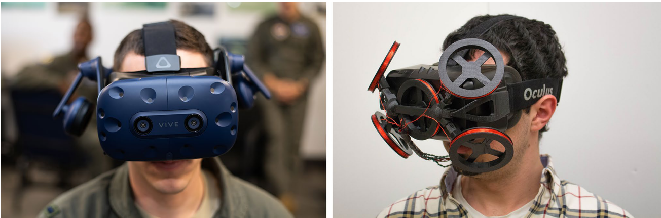
Fig. 1 An HTC Vive Pro Eye HR HMD with integrated VOG-based eye trackers (left). A VR HMD with scleral search coil-based eye tracking system (right). Image courtesy of Whitmire et al. (2016)

and classification methods that make use of all available information are therefore an active area of research (Kothari et al. 2020).