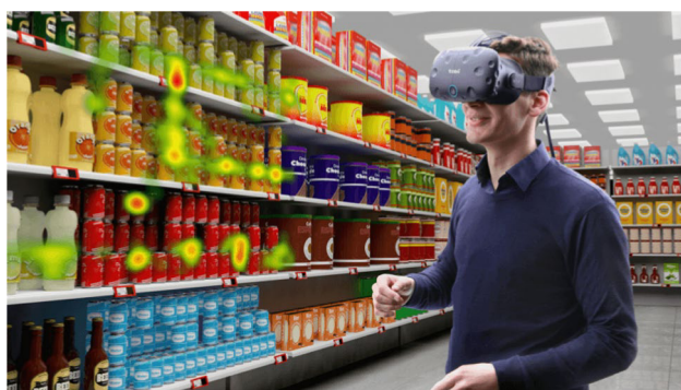
Fig. 4 A combined image showing which items in a virtual store attract the user's visual attention.

Product attributes, such as its package's design, play an important role in marketing and influencing the consumer's purchase choice. Creusen and Schoormans (2005) identified that product appearance plays an important role, which includes drawing the consumer's attention among other roles. Various studies have shown that consumers choose the products that attract their visual attention (Bigné et al. 2016). Visual attention (see section 3.4) can effectively be measured using eye tracking. Most studies on product appearance are conducted in laboratory settings which fail to capture the visual context in which the product will be situated. Product appearance studies in the real world, on the other hand, fail to control all experiment variables which could greatly affect experiment results. VR may help researchers to close this gap by allowing them to rapidly develop new product prototypes and place them in immersive environments while giving the experimenter the ability to control all aspects of the experiment environment. A particularly good example is a recent study conducted by Meißner et al. (2019) that combines VR with eye tracking to provide a naturalistic environment for research on package design. Rojas et al. (2015) conducted a study in which the consumer perception of a virtual product with photographic representation of the