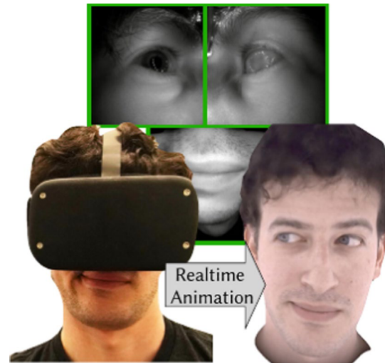
Fig. 3 Photorealistic virtual avatar created through reconstruction of gaze and eye contact.

Eye tracking has the potential to enable accessible and handsfree ways of input that require very little exertion (Majaranta and Bulling 2014). However, one technical challenge common to eye movement-based interaction applications is the rapid, accurate and precise identification of these eye movements that allows them to be used in real time as an input signal. Consequently, the exploration of new techniques that improve the quality of eye tracking data is an area that needs further research. With more sensors being embedded in VR HMDs, sensor fusion (i.e., combining eye tracking with other sensors) is another area for future research that holds promise to further increase the accuracy and robustness of using eye tracking for input. Eye tracking could be explored to enable individuals with severe motor impairments (i.e., quadriplegics or persons who are locked in) to navigate their avatar in VR. Though there might be significant challenges with using eye tracking for precise navigation, some sort of semi-autonomous approach could be used with a user providing broad navigation instructions. Of interest would be how this approach would affect VR sickness. Finally, our review reveals that there is scant literature on the use of eye-based input for manipulation tasks in VR.