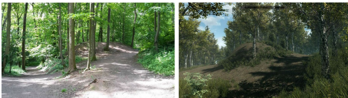
Fig. 1 The physical forest (left panel) and the VR forest (right panel). Additional screenshots are summarized in the online supplemental material