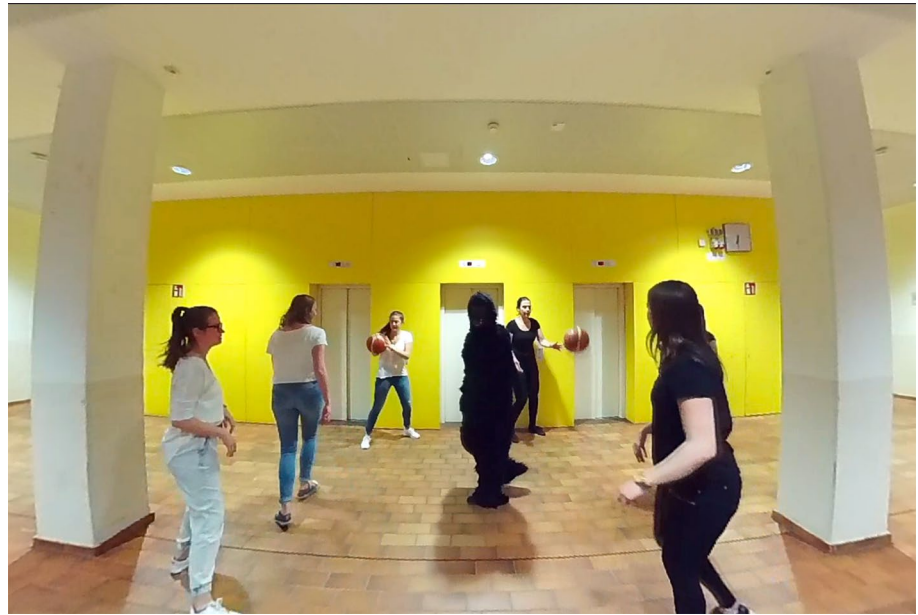
Fig. 1 Screenshot from the video. The person in the gorilla costume is in the middle of the scene. The participants in the VR conditions were instructed to keep the two pillars in sight at all times

A 3D360° camera, set to a height of 1.63 m (average eye level of Europeans), was used to create a 4K video at 60fps and 78 s in length. The footage was taken with an Insta360 Pro ( https://www.insta360.com/product/insta360-pro ) and rendered with the Insta360 Stitcher ( https://www.insta360.com/download/insta360-pro?inspm=77c1c2.89f76e.0.0 ). The setup of the camera was stationary; hence, the participants in the VR condition could not change perspective by walking around, e.g., discover hidden objects behind the pillars (Fig. 1).