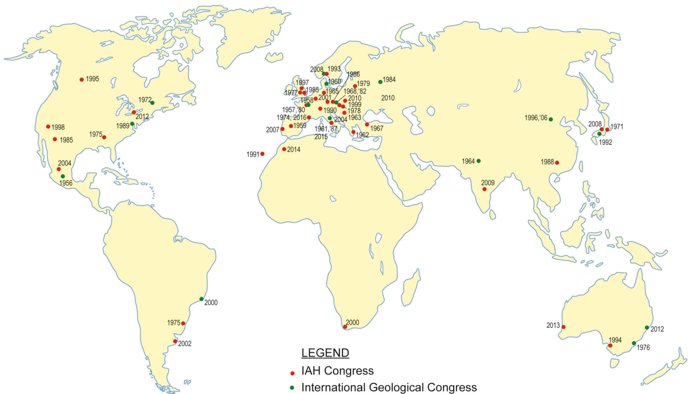
Fig. 6 Locations of IAH congresses