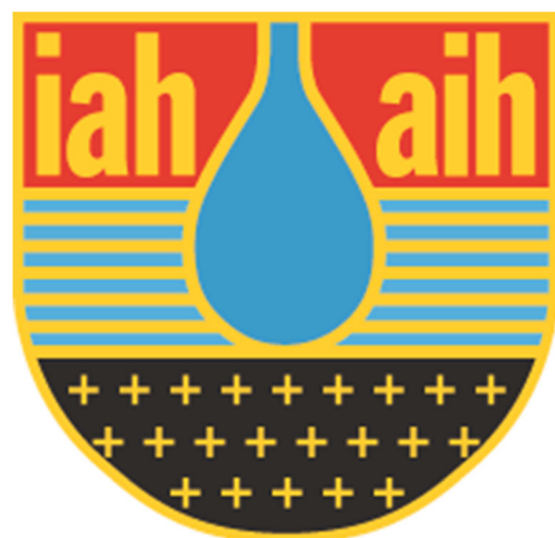
Fig. 4 Logo of the International Association of Hydrogeologists (IAH)

crosses in the lowermost part of the shield use the established geological notation for crystalline igneous rocks. The bands of blue and yellow across the centre of the shield represent sedimentary formations containing water and the uppermost solid part of the shield represents the soil and an impermeable confining layer. The blue symbol in the centre represents a drop of water moving through this sequence. Thus, the logo encapsulates the very essence of hydrogeology; understanding and depicting the subsurface, recognising aquifers and non-aquifers and the way in which groundwater derives from infiltration from the land surface. The logo was published for the first time at the top of the News and Information newsletter in May 1985 and widely used at the 1986 congress, for which the first logo lapel badges were produced. In 1989 “aih” was added to the logo. Using both “iah” and “aih” balanced the logo design and indicated the association's name in the principal IAH languages of the time. Subsequent IAH councils and members have wished to retain this strong link to those responsible for the founding and growth of IAH during its formative years. For the 60th anniversary, minor amendments have been made to improve the clarity of digital reproduction of the logo in a range