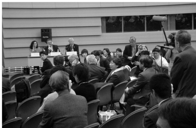
Fig. 8 Public discussion during an IAH/UNESCO session at the 2003 Kyoto World Water Forum, Japan

greatly encouraged younger IAH members to participate in all of the association's activities, especially the other commissions and networks and the national chapter committees, setting up national ECHN groups and providing a welcome and much appreciated voice for early career professionals as an observer at Council meetings.