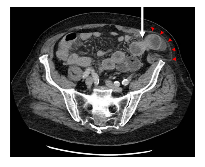
Fig.3 Spigelian Hernia on CT scan. Abdominal CT-scan depicting left-sided incarcerated Spigelian Hernia with small bowel content (arrow). Note the intact External oblique aponeurosis (arrowheads)