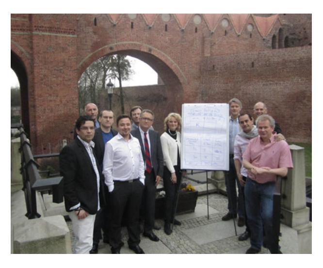
Fig. 1 The EHS classification for parastomal hernias is a proposal formulated during a consensus meeting in Torun, Poland, on April 20–21, 2012

hierarchical subclass relationship were needed. To make this classification useful, we decided that the level of granulation (measurements needed to classify) should be low, and natural language should be used. By mentioning the "natural language" abandonment of abstract abbreviations, we targeted sharp classification of meaning of terms and the challenge of pluralism of the cultures. These rules are usually useful in the methodology of taxonomy; they are used to validate various classifications.