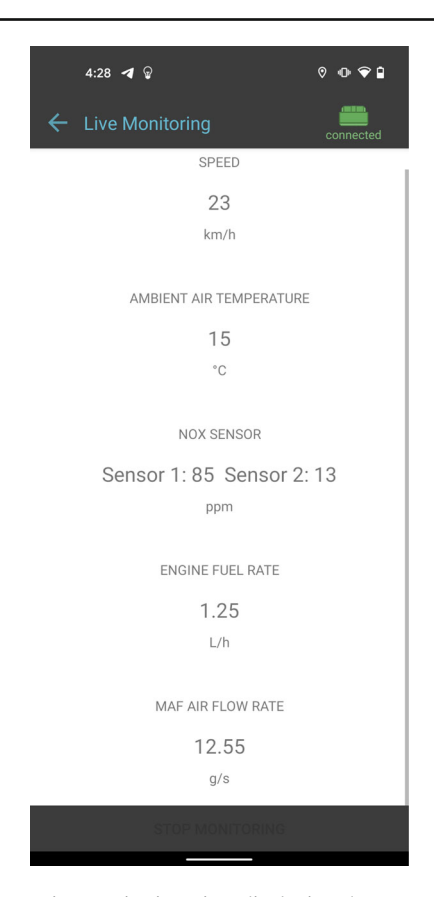
Fig. 3 Diagnostics monitoring view displaying the most recent diagnostics data

In the screenshot, the drive is still in progress and inconclusive, indicated by the question mark. Instead, the UI can also indicate success or failure. The latter verdict can occur far before the time limit is reached, caused by an irrecoverable situation such as transgression of the 160 km/h speed limit. We remark that currently LOLADRIVES does not always detect if for a test the RDE constraints are irrecoverably violated. For example, if a test has run for 119 minutes, but there are still at least 3 km remaining to drive in the motorway mode to cover the 23 % share of the total trip distance; then, this would require the driver to drive faster than 160 km/h for the remaining minute. Since this is forbidden by the regulation, the RDE constraints are in this moment irrecoverably violated. In the converse case in which the indicator reports a successful drive, this concerns the trip up until this moment. Together with the regulatory constraints, this implies that the current verdict can alternate between success and inconclusive from minute 90 to 120 and also jump to failure. As there is no specific point in time when the test ends, the app continues to compute statistics until the tester manually stops it or the 120-min mark is reached. Beneath the status indicator is the green NO_x bar displaying the total NO_x emissions (RTLOLA nox_per_kilometer stream). The two markings denote the permitted thresholds of 168 mg/km for cars