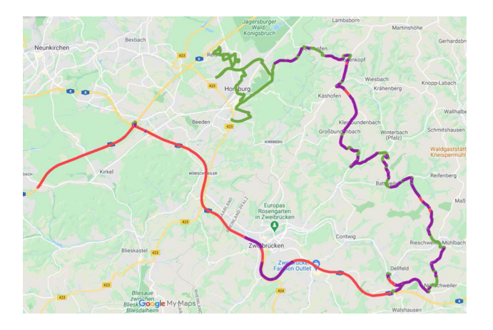
Fig. 9 Map with the A20.2 test route highlighted

recorded made it evident that the car had been cleaning its diesel particulate filter and NO_x adsorber during the test. We are, however, not certain if this is the reason for the higher emissions. Anyway, if A21.3 were a valid RDE test, the overall NO<sub>x</sub> emissions are still below the threshold of 120 mg/km defined in the regulation.