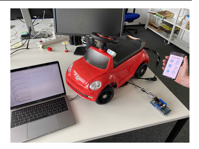
Fig. 8 OBD simulator

Privacy An important feature of LOLADRIVES and CDP is the support for data donation; users can opt-in to upload the