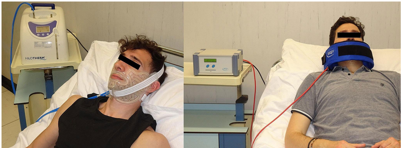
Fig. 1 Hilotherapy applied facemask on the left and PEMF applied facemask on the right

the technical suppliers. Our protocol has been codified to maximize the swelling prevention efficacy by the emission of low-frequency waves treatment.