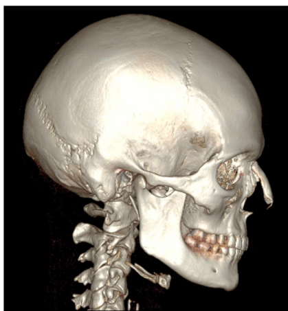
Fig. 4 CBCT scan 2 years postoperatively of the patient in Fig. 3

Using readily available hydroxyapatite granules (ProOsteon), a fibrin sealant, and the Surgicel® wrap, the advantages of some of the above-mentioned techniques can be used. The porosity of the granules allows fibro-vascular ingrowth to enhance stabilization and vascularization of the implant. ProOsteon does not require special handling or reconstitution, and is shipped sterile and ready-to-use. A second surgical site can be avoided by respecting the algorithm proposed by Bohluli et al., who suggested the use of easier and more conservative techniques first before considering secondary donor sites in cases where no suitable result can be achieved [6]. The manufacturer (Biomet) currently states that ProOsteon degrades after approximately 6 months [10]. However, there are no conclusive data regarding the long-term