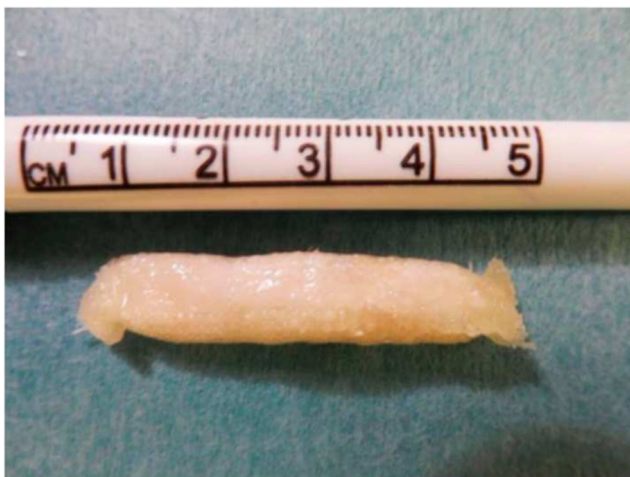
Fig. 2 The hydroxyapatite Turkish Delight ready to implant

We found this modified Turkish Delight method to be a reliable technique for the correction of nasal dorsum deficiencies. A total of four patients with a structural deficiency of congenital etiology, including one patient suffering from a unilateral cleft lip, were treated in this manner and followed for 4 months to 2 years. All patients observed were women between the ages of 17 and 32 years without significant previous medical history. Although no quantitative measurements were performed in our small series, clinically stable and satisfactory results were achieved (Fig. 3). CBCT images, taken up to 2 years after surgery, support our clinical findings of stability (Fig. 4). Moreover, they show a complete mineralization of the Turkish Delight over time, with discrete hydroxyapatite granules still apparent at 4 months postoperative, to become a homogenous sintered mass 1 year after (Fig. 5).