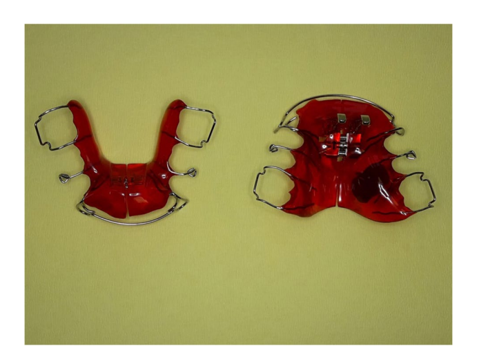
Fig. 2 Example of the construction of the Sander bite jumping appliance (BJA) with incorporated temperature-sensitive microsensor (TheraMon®, MC Technology GmbH, Austria) in the upper plate

per month) in cases of initial lingual tipping of the lower molars. Activating the lower expansion screw led to leveling the curve of Wilson. The therapeutically desired jaw relation was three-dimensionally registered with a wax construction bite with one-step mandibular advancement. In the sagittal plane, the mandible was positioned in super-class I molar relationship. In the transversal plane, a gnathic midline shift was corrected and in the vertical plane, the mandible was positioned with a 2-mm frontal vertical opening. Activation of the transversal screws affected only incisor position if it was desired, otherwise the labial bow was deactivated during the expansion period. The bite registration, establishing a super class I molar relationship, determined whether the upper labial bow needed activation or deactivation and the extent to which upper incisors had to be reclined to achieve a physiological overjet of 2 mm. In every patient, lingual reduction of the lower plate was performed, and the labial bow was activated to prevent significant dental side effects, such as proclination of the lower incisors. The patients were motivated to wear the appliance more than 12 h/24 h. To measure the wear time objectively, a temperature-sensitive