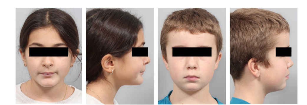
Fig. 1 Representative patient examples for patients with initial lip incompetence (LI): a enface and b profile and with initial lip competence (LC) c enface and d profile

The patients were treated using the Sander bite jumping appliance (BJA). The appliance was constructed as described by Gazzani et al. [5]. The expansion screw in the upper jaw was activated (one turn = 0.25 mm per week) in cases of initial transversal discrepancy. The expansion screw in the lower jaw was activated (one turn = 0.25 mm