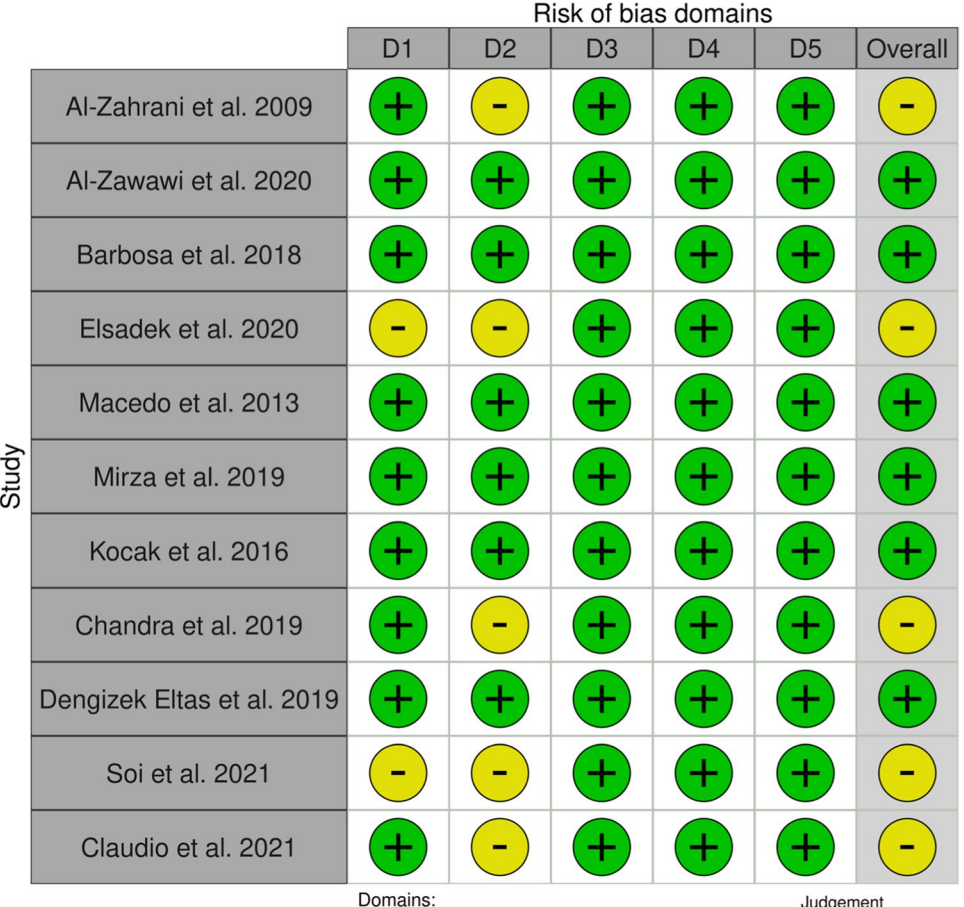
Fig. 2 Diagram showing the results of risk of bias evaluation

D1: Bias arising from the randomization process. D2: Bias due to deviations from intended intervention.