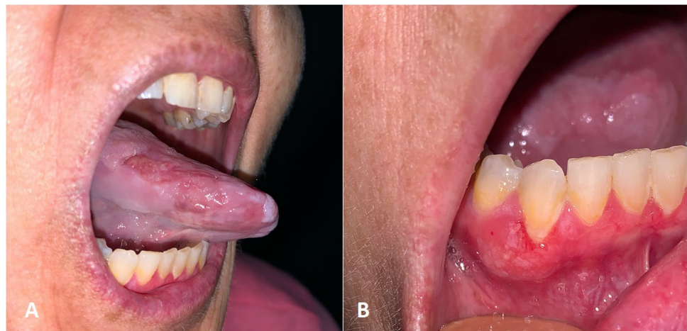
Fig. 2 UPN 230 presented to the outpatient clinic with a painful swelling of the right side of the tongue (A). A concomitant ulceration of the adherent gingiva in the fourth quadrant was observed as well during the clinical examination (B). Bioptic examination of the lesions documented a squamous cell carcinoma in both cases

UPN 230 She presented to the outpatient clinic with a painful swelling of the right lingual margin. During the clinical examination, a concomitant ulceration of the adherent gingiva in the fourth quadrant was observed (Fig. 2). A prompt biopsy of both lesions led to the diagnosis of two moderately differentiated SCC. Preoperative radiological examinations showed no cervical nor distant metastasis. The patient underwent partial tongue resection and partial mandibulectomy, with clear surgical margins. The mandibular defect was contextually reconstructed with a right facial artery musculo-mucosal (FAMM) flap. The patient is now