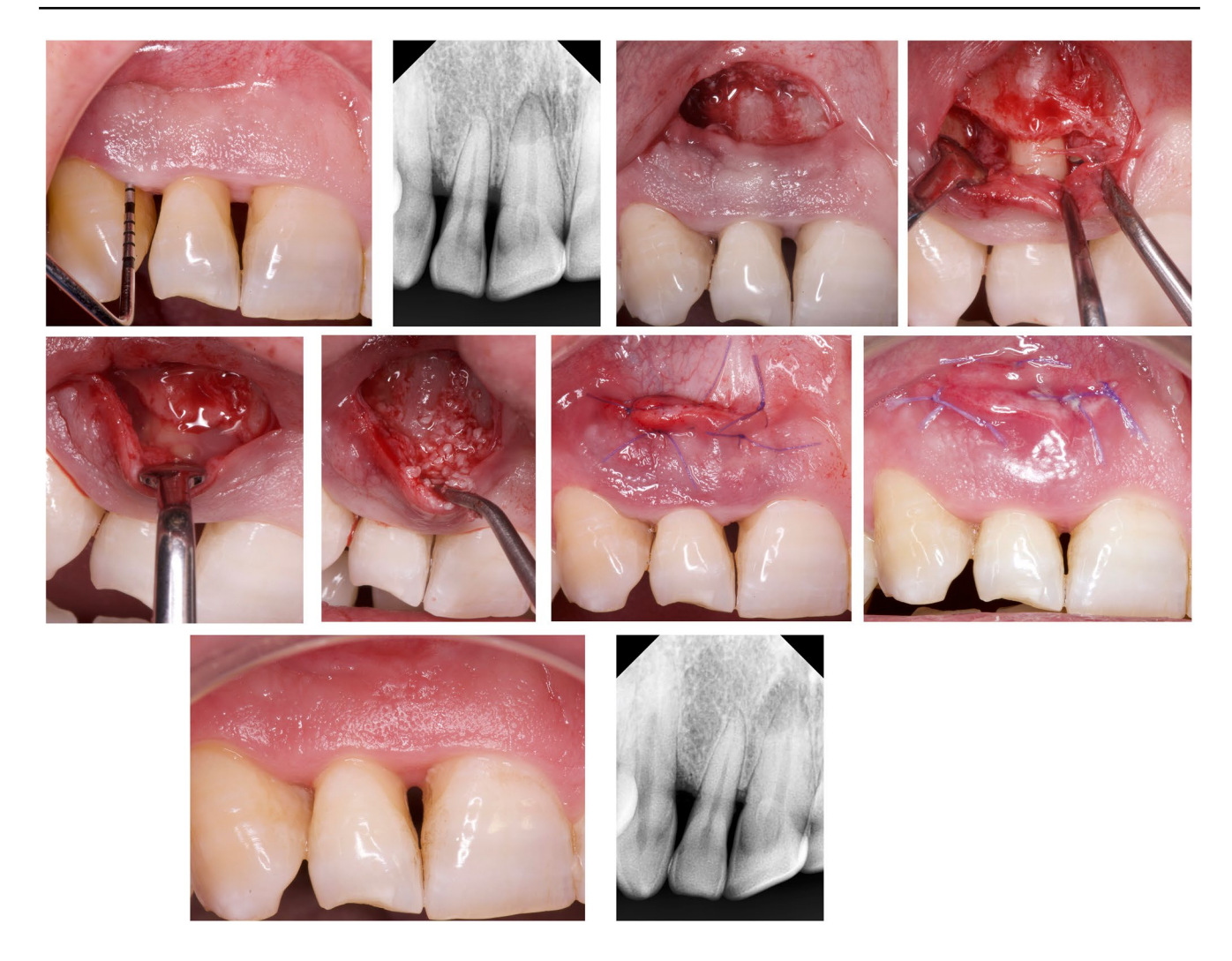
Fig. 3 NIPSA+EMD+BS. a - b Interproximal PD and periapical X-ray before surgery. Deep combined non-contained intrabony and supra-alveolar periodontal defect. Soft tissue superficial fibrous tone after the pre-surgical procedures, and "red-wine" translucent from the deep aspect. c Apical incision in the mucosa located on the cortical bone tissue, as far as possible from the marginal tissues. d Elevation of the tissue coronal to the incision to expose the bone peaks delim-

iting the non-contained intrabony defect and coronal traction of the interproximal tissue to expose the supra-alveolar component. e-f Biomaterials application. g Suture. h Primary wound closure and soft tissue preservation 1 week post-surgery. i-j One-year follow-up. Soft tissue preservation and healthy aspect. Periapical X-ray (no standard-ized radiographs)