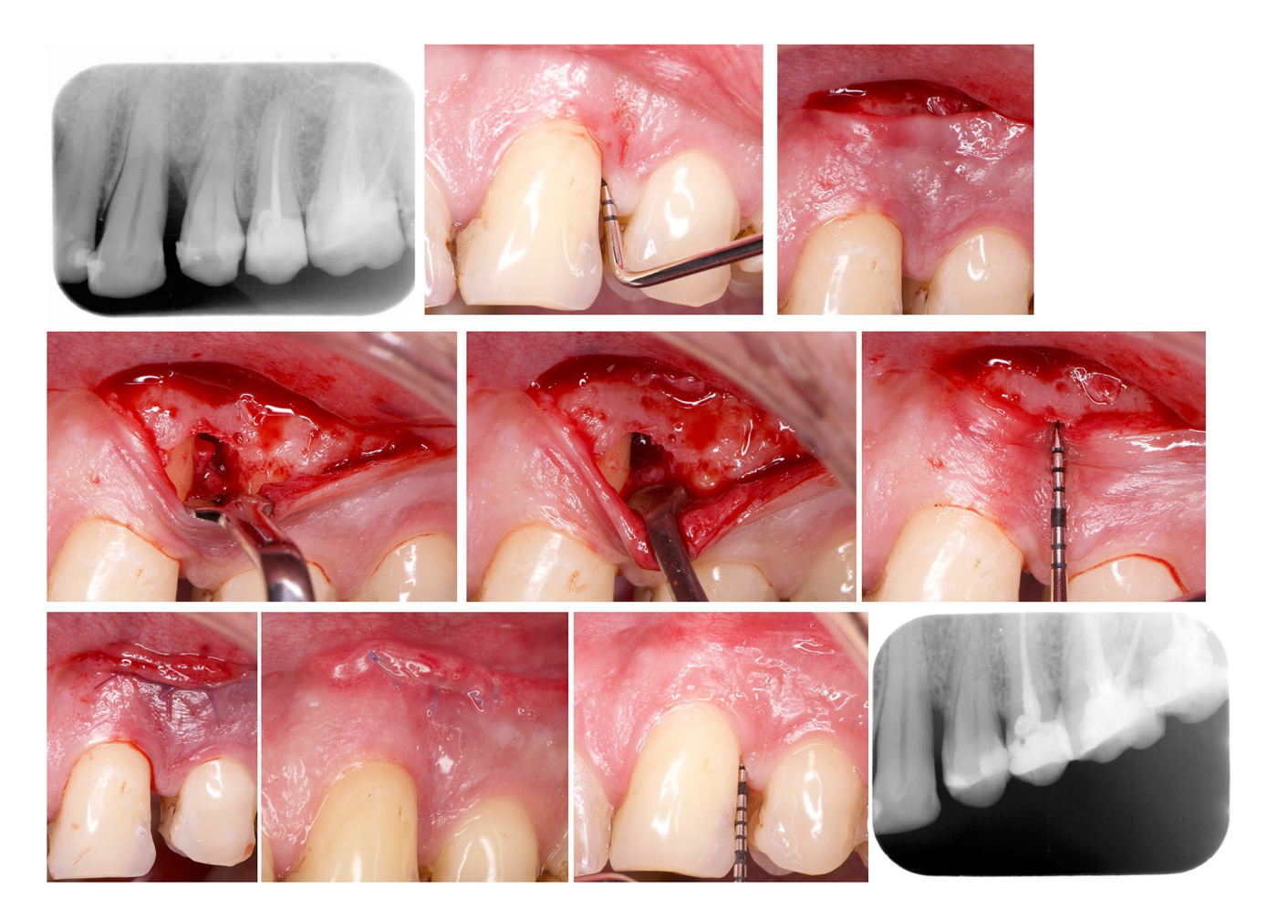
Fig.2 NIPSA EMD without BS. a Periapical diagnostic X-ray. b Interproximal PD before surgery. c Apical incision. d Elevation of tissue coronal to the incision to expose the bone peaks delimiting the defect and coronal traction of the interproximal tissue to expose the supra-alveolar component. Internal appearance of the periodontal pocket around the affected root surface. e Intrabony component of the defect after debridement of granulation tissue and removal of the

All patients received amoxicillin 500 mg every 8 h for 5 days (azithromycin 500 mg once daily for 3 days in patients allergic to amoxicillin). Postoperative pain and inflammation were controlled using ibuprofen 600 mg (or acetaminophen 1 g in patients allergic to ibuprofen). Patients rinsed with 0.2% chlorhexidine twice daily for 1 week, without mechanical hygiene on the surgical area. Sutures were removed at