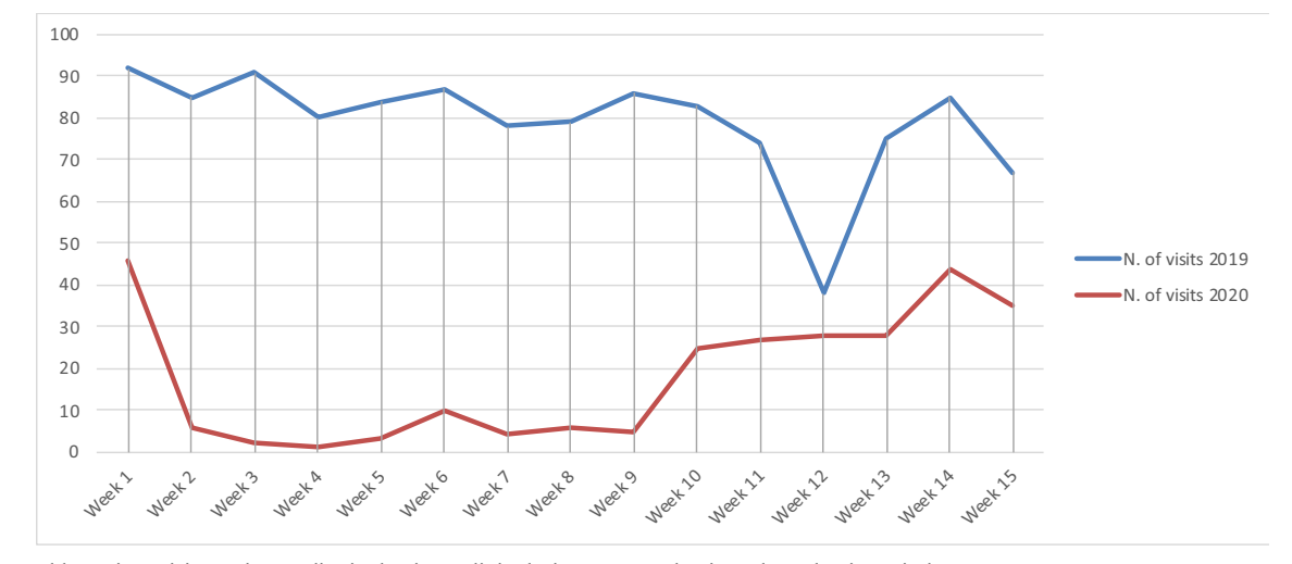
Fig. 2 Weekly patient visits to the paediatric dentistry clinic during non-pandemic and pandemic periods

non-pandemic period, whereas visits regarding dental trauma were low. Our findings are in-line with previous researchers reporting dental pain from pulpal inflammation, abscess, or swelling as the most common reason for patients seeking treatment [9, 10, 17–19]. Although pulpectomy was situated as management of signs and symptoms related to dental pain and abscess/swelling during the non-pandemic period, extraction was preferred to refrain from the high risk of aerosols (Table 3). Implementing alternative treatment choices during COVID-19 pandemic will potentially have some consequences; hence dental professionals should provide additional information to parents regarding space management and suggest strongly the use of space maintainers when extraction was chosen instead of pulpectomy.