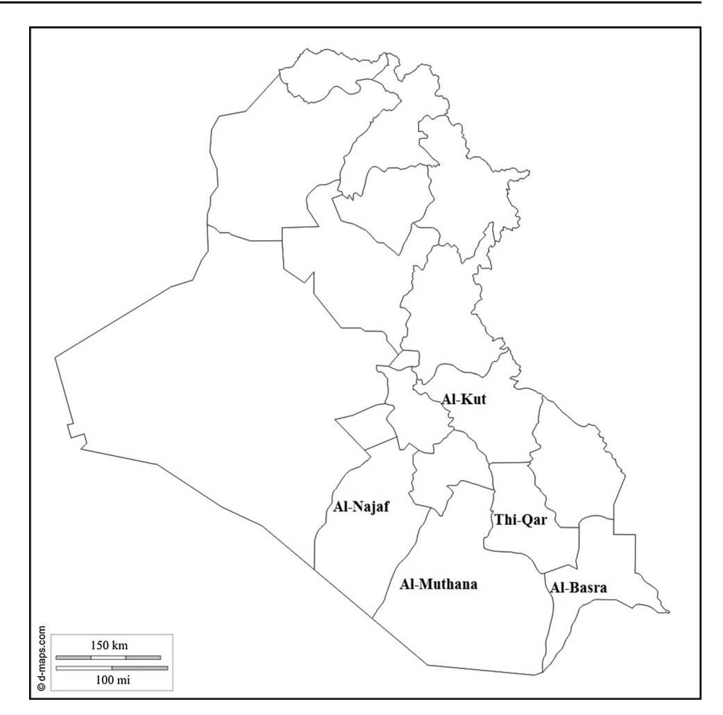
Fig. 1 The sample-collection areas for genotyping of infectious bronchitis viruses from broiler farms in Iraq between 2014 and 2015

MEGA 5.1 software, and each tree was produced using a consensus of 1000 bootstrap replicates [31]. The nucleotide sequences of a partial segment of the S1 gene were compared with several S1 sequences from GenBank, including H120 (JN600610), Sul/01/09 (GQ281656), GRAY (L14069), Connecticut (IBAS1A), Kurdistan-Erbil 12VIR 10065-16-2012 (KF153245), IR-Razi-HKM1-2010(JN600 609), IR-Razi-HKM3-2010 (JN600612), PCRLab/06/2012 (JX477827), QX (AF193423), 4/91pathogen (AF093794), 4/91 vaccine (KF377577), and IS/1494 (Table 3). The S1 gene sequences of the IBVs were submitted to the NCBI GenBank database with the accession numbers KU143883-KU143914.