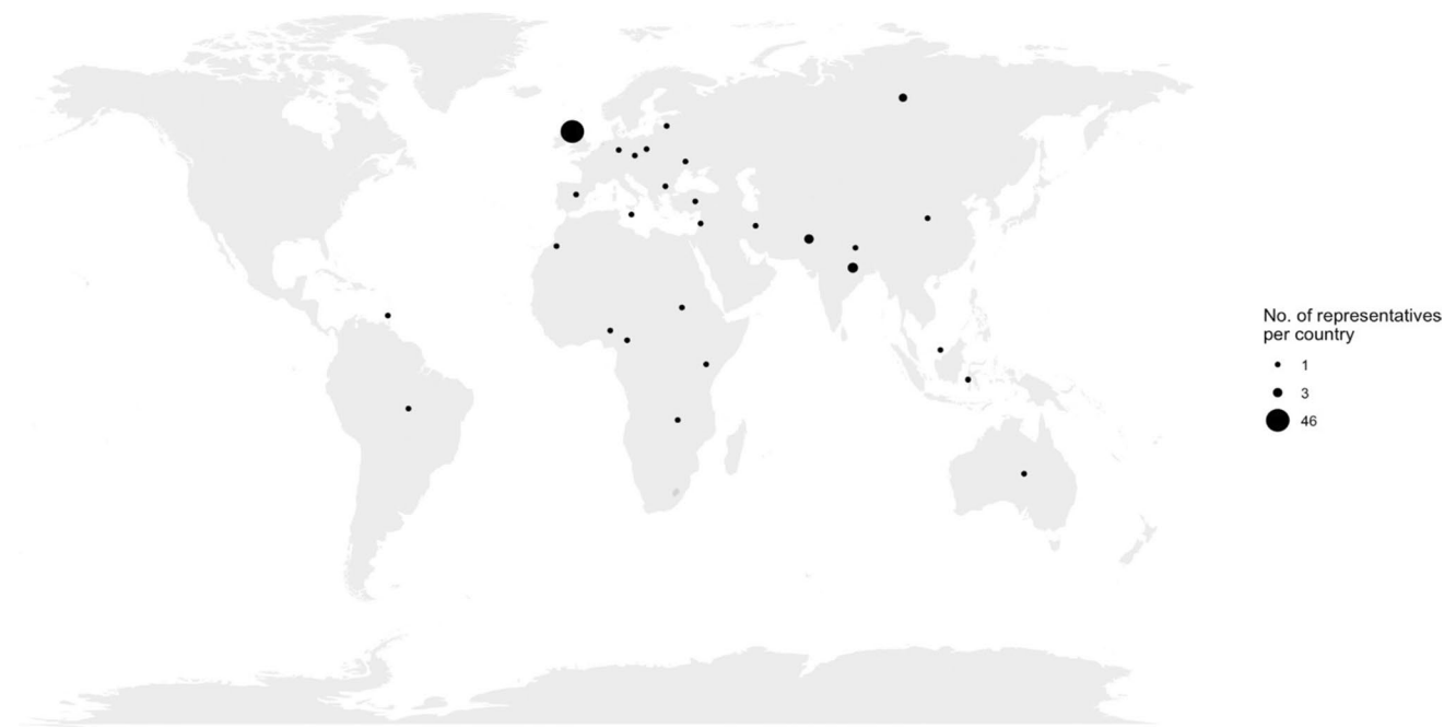
Fig. 2 Bubble map of the location of NANSIG representatives worldwide. Bubble sizes correlate to the number of representatives in each country

high-quality multi-centre research; some of which has informed national specialty reports [16, 21]. To date, NANSIG has been involved in seven (three complete, four ongoing) national research, audit and quality improvement projects, with several in the process of being developed (Table 1). The project themes are uniquely conceptualised by students or junior doctors in the NANSIG core committee. Many of NANSIG's past and ongoing projects have received the support from SBNS Academic Committee and theBNTRC in the form of project supervision and guidance, protocol review and identifying members of the data collaboration team.