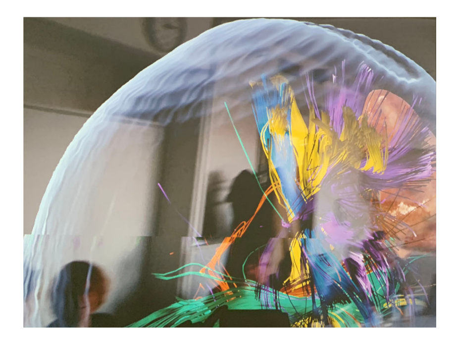
Fig. 3 The figure shows another screenshot visualizing the participants view during the application of AR for fiber dissection. The different colors show different tracts. The tractography model is projected in the room

purposes (Table 2). Moreover, proven by the composition of the participants, various disciplines frequently use this technique for the visualization of white matter pathways, and 92.3% of participants evaluated the presented cases as reflecting their clinical reality. Hence, the present results of the evaluation of AR for fiber dissection as a new