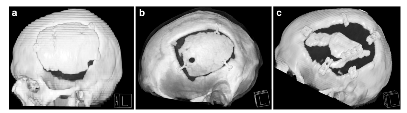
Fig. 1 Three-dimensional cranial computed tomography reconstruction images showing examples of bone graft resorption graded as a mild: less than 50% of the graft circumference affected, b moderate: more than 50%

Detailed information regarding patient selection and cohort arrangement is obtained from Fig. 2. A total of 181 patients received secondary CP between 1984 and 2015. DC was performed in 22 patients for indications other than severe TBI