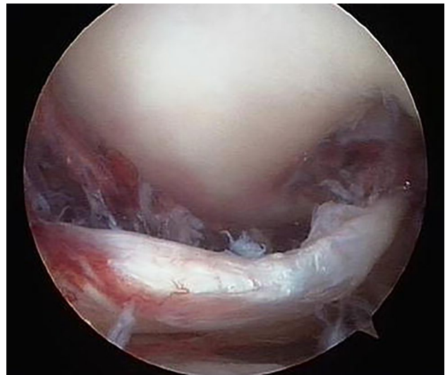
Fig. 4 Knee arthroscopy showing intra-articular dislocation of the vastus medialis reported by Bistolfi et al. [16]

While it is well known that KDs pose at risk the common peroneal nerve (around 20%) and the popliteal artery (around 19%) [1–4, 10], there are limited data regarding these complications in IKDs. This systematic review shows no vascular injuries or compartment syndrome cases were present. One case of both peroneal and tibial nerve palsies [12] and one case of partial sensory loss of the common peroneal were reported [14]. These findings are consistent with the most recent SR reporting the rate of neurovascular injuries for the IKDs category is lower than for KDs [8]. Malik et al. suggested that the low rate of neurovascular injuries for IKDs is derived from the low kinetic causative mechanism since the valgus force is less likely to strain the vessels and nerves that lie anatomically more laterally in the popliteal fossa [8]. Mentioning other complications, some authors [12] did not report them, but when present, knee stiffness and knee flexion contracture were the most common [15].