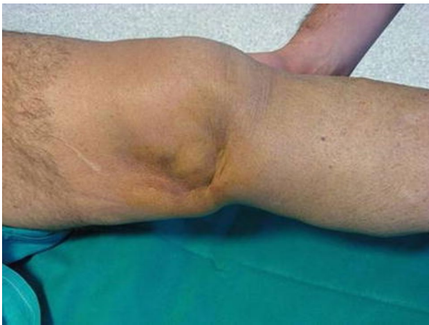
Fig. 3 Dimple sign: skin invagination and entrapment in the medial joint space reported by Bistolfi et al. [16]

described by Durakbaşa et al., where entrapment of the medial meniscus did not manifest as a dimple [29]. Malik et al. described this sign in 70% of patients [8]. In this SR, percentages were not calculated since not all the Authors reported it [13]; nonetheless, Xu et al. [12] outlined it in all the patients, and Zhang et al. [14] reported it in all the acute IKD cases.