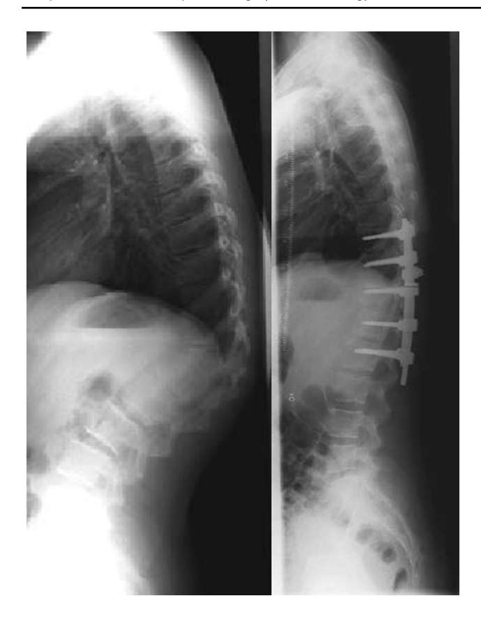
Fig. 1 15-year-old boy with congenital kyphosis at the thoracolumbar junction. Standing lateral radiograph before and after Th12 PVCR and instrumentation from T9 to L2 at 2-year follow-up

prophylactic cefuroxime and vancomycin 30 min before incision; cefuroxime was continued for 72 h postoperatively. Thirteen patients (48.1%) were immobilized using a rigid thoracolumbosacral orthosis (TLSO) for 4 months.