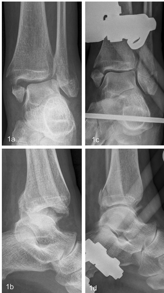
Fig. 1 69-year-old female patient suffered an AO 44B3 fracture (a, c). Due to poor state of the soft tissue, the fracture was stabilized with an AEF on the day of trauma (b, d)

triangular external fixator (AEF) is an ankle joint bridging fixator indicated for the purpose to enable the soft tissues to recover, thus reducing the complication rate of definitive treatment with open reduction and internal fixation (ORIF) with plate, which is the current gold standard [10–13].