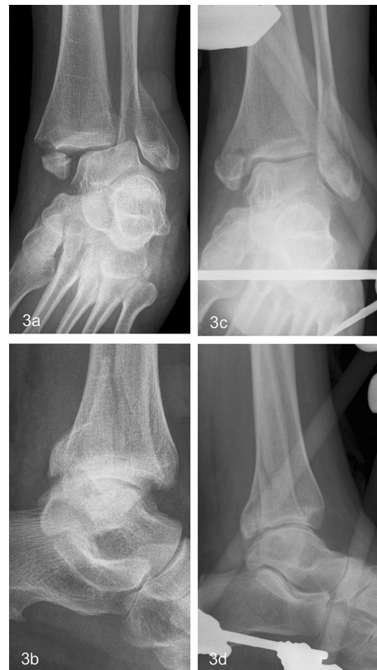
Fig. 3 68-year-old female patient suffered an AO 44B3 fracture (a, c). Due to incongruity in the cast and poor soft tissues, stabilization with an AEF was done 3 days posttraumatic (b, d)

Statistical analysis was performed with SPSS (version 24, Chicago, Illinois, USA), quantitative variables were presented as means and standard deviation (SD), maximum, minimum, and medians. Chi-square tests were used for categorical data and unpaired t-tests for continuous data. A p value < 0.05 was considered to be significant.