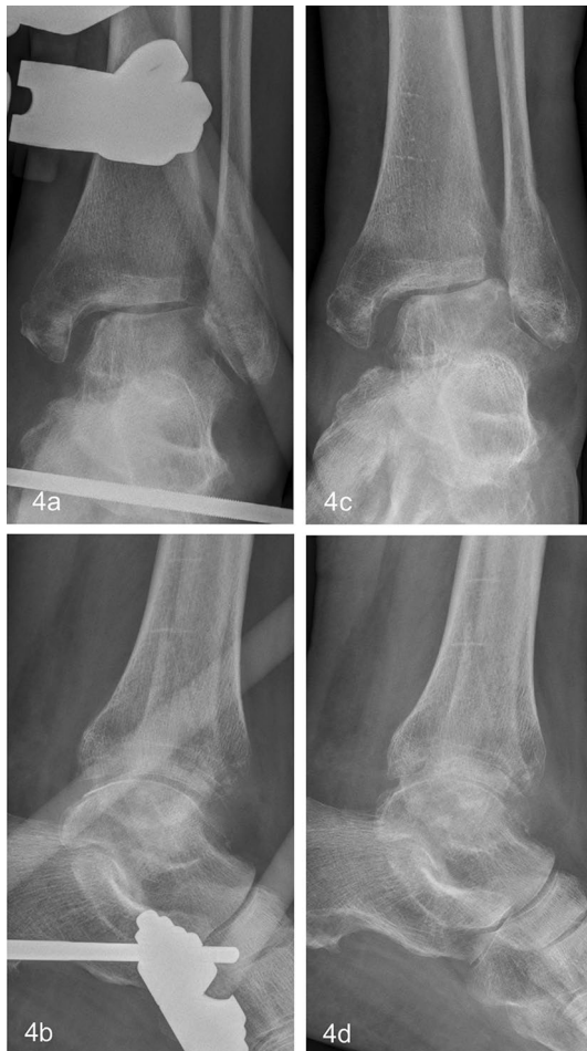
Fig. 4 Same patient as in Fig. 3. Definite treatment with AEF was indicated due to the lack of soft tissue healing. a, c show lateral subluxation 60 days into therapy. Posttraumatic arthrosis with lateral incongruity was established 90 days after trauma and AEF removal after fracture healing ( b, d )

to joint incongruity (secondary sHEF group; Figs. 1c, d and 2a, b). Two patients were converted to an external Ilizarov ring fixator. The patients' flowchart is illustrated in Fig. 5.