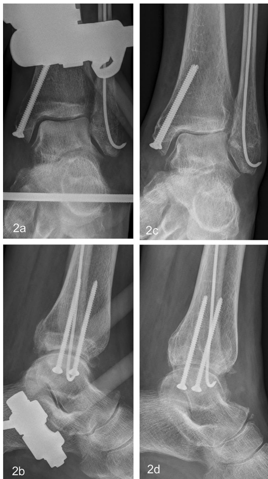
Fig. 2 Same patient as in Fig. 1. Due to lack of recovery of the soft tissues, conversion with additive osteosynthesis into secondary HEF was performed 9 days after trauma (a, c). AEF removal 60 days after trauma with preserved congruity and joint space (b, d)

weight bearing of 20 kg and orthopedic walking aids under the supervision of a physiotherapist.