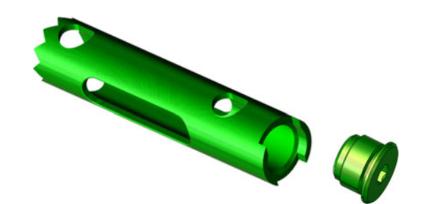
Fig. 5 The implant Calcanail. The picture shows the teeth at the tip of the nail, the windows for anchorage of the graft, the holes for locking screws, and the cap