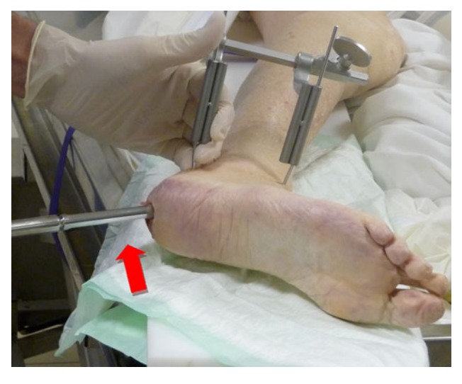
Fig. 2 This cadaveric view shows the caspar distractor inserted on the talar and calcaneal pins and the direction of the hollow reamer ( red arrow ) (colour figure online)

Two 3.2 mm pins are then placed laterally, one in the calcaneal posterior tuberosity, the other in the lateral tubercule of the talus (Fig. 2). The K wire inserted in the posterior tuberosity is placed 10 mm above the future tunnel, or inferiorly if the fracture is a tongue-type fracture. The talar K wire is inserted in the lateral tubercule, at the center of the talar dome. A Caspar distractor is then fixed on these wires in order to correct the varus deformity of the great