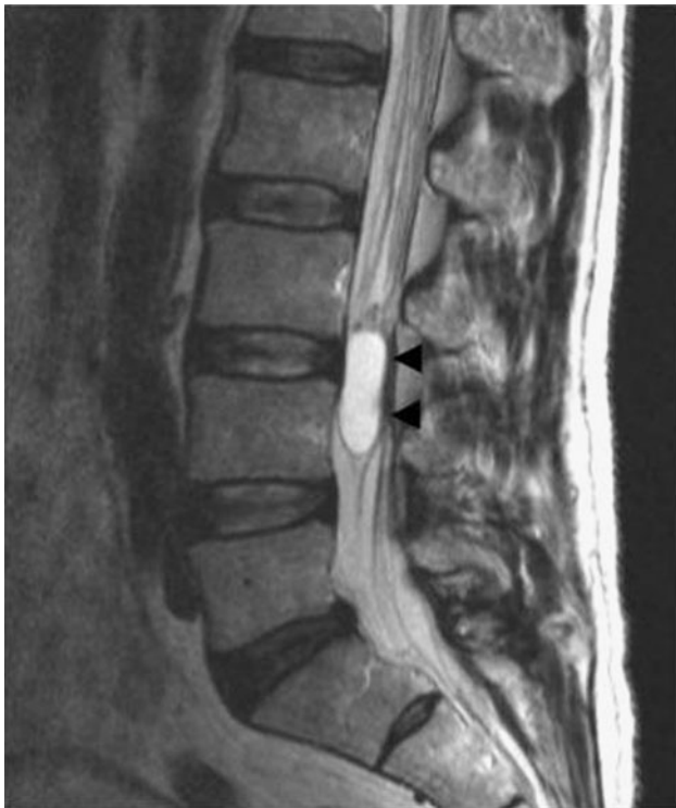
Fig. 1 Preoperative sagittal T2-weighted MRI scan of the lumbar spine showing a hyper-intense intradural tumor (indicated by black arrowheads ) at L3–L4 level occupying the complete spinal canal, with the characteristics of a Schwannoma

pseudomeningocele at L4 level. Furthermore, one or more cauda equina fibers appeared to herniate through a small dura defect (Fig. 2).