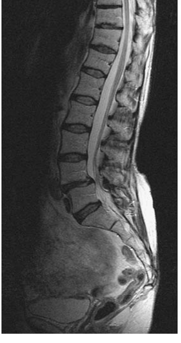
Fig. 2 Pre-operative T2-weighted a transversal and b sagittal MR Image showing lumbar spinal stenosis due to discopathy, facet arthritis, ligamentum flavum hypertrophy and anterolisthesis

these, only 1 patient had a slip of more than 25% (27.6%). There was no relation between the severity of the slip and the failures in our cohort. Our indication for re-intervention included recurrence or persistent and unremitting low back pain and persistent or progressive neurogenic claudication with radiculopathy. Both clinical and radiological findings were considered together for diagnosing failure of treatment. Unfortunately, we did not enclose pre- and post-operative outcome measurements. However, since the surgical goal of the X-Stop include pain reduction, improvement of neurological symptoms, and improvement of quality of live, re-intervention was considered as the endpoint for failure.