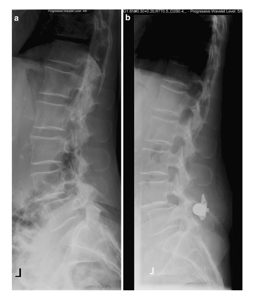
Fig. 1 a Pre-operative lateral plain radiograph. b Post-operative lateral plain radiograph. X-Stop positioned at the level L4–5

treatment. The indication for treatment was a percentage of