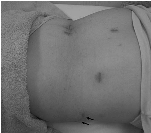
Fig. 2 Wound view after laparoscopic distal pancreatectomy with splenectomy. A small incision was made on the flank region (arrows), where the wound was less noticeable from the anterior view, in order to remove the resected tissue

The resected tissue was placed in a surgical bag (ENDO-catch II; Tyco Japan), and when the spleen was conserved, resected tissue was removed from where the trocar had been inserted. When the spleen was also resected, except for when Lap-DP was converted into a hand-assisted procedure (HAP), a small incision was made on the flank region, where the wound was less noticeable from the anterior view, so as to be able to remove the resected tissue (Fig. 2). When the spleen was conserved, the splenic artery and vein were conserved in all patients, and Warshaw and colleagues' procedure [27] was not employed.