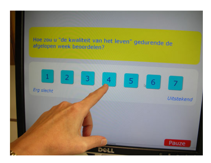
Fig. 1 Example of the user interface of OncoQuest

The EORTC QLQ-H&N35 module covers specific HNC issues and comprises seven subscales: pain (four items), swallowing (five items), senses (two items), speech (three items), social eating (four items), social contact (five items), and sexuality (two items). There are ten single items covering problems with teeth, dry mouth, sticky saliva, cough, opening the mouth wide, weight loss, weight gain, use of nutritional supplements, feeding tubes, and pain-killers. The