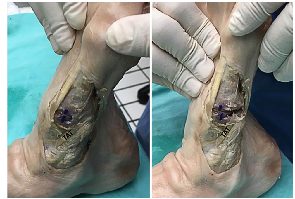
Fig. 2 a Cross-glide test on intact tibialis anterior tendon (TAT) inserting at first tarsometatarsal joint (TMT-1) in anatomical specimen as earlier described [12] b Cross-glide test after transection of TAT in TMT-1 area in the same specimen, resulting in instability, as indicated by blue marks