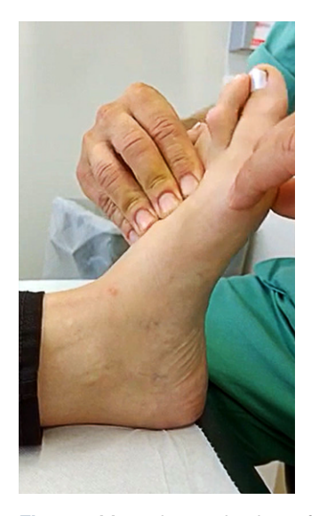
Fig. 1 Manual examination of first ray mobility using the cross-glide test. The ankle should be held in a neutral position during the examination, in maximum eversion of the foot whilst the lesser metatarsals are fixed and the first metatarsal is moved in a dorsoplantar direction by the examiner (also see Supplementary video)

The cross-glide test is a clinical testing method for TMT-1 instability. Similar to earlier described tests, fixation of the ankle in a neutral position, which