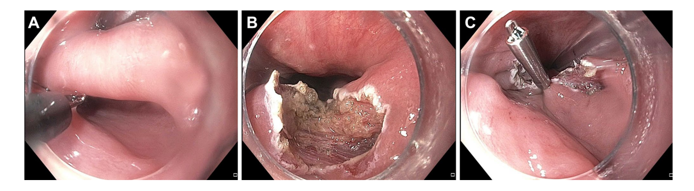
Fig. 1 Steps of Flexible Endoscopic Septotomy (FES) for Zenker's diverticulum: A A hook knife (Olympus Medical, Tokyo, Japan) is used to directly incise the septum. B The muscular septum is incised

to the base of the diverticulum C One endoscopic clip placed at the base of the incision.