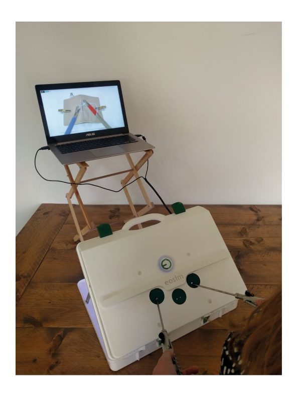
Fig. 1 The eoSim-augmented reality laparoscopic simulator interface

All statistical analyses were performed with IBM's SPSS statistics v.25 package. First the total scores for instrument handling, tissue handling and the amount of errors were calculated. Following, the inter-observer reliability was assessed by using Cohen's Kappa analysis for the task scores of instrument handling and tissue handling. A