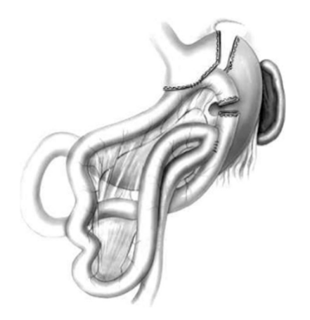
Fig. 1 The principle behind the intact mesentery LRYGB (IM-LRYGB) (Figure from original article describing the method [7])

Prospectively collected data from an internal quality registry of all bariatric procedures performed at Danderyd Hospital and patients' medical records were retrospectively reviewed. Data on pre-operative BMI, age, gender, post-operative complications, surgical method, reoperations, and endoscopies were collected and analyzed. All operations were performed