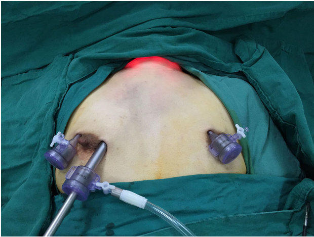
Fig. 2 External view after positioning the trocars