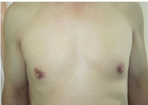
Fig. 4 Incision scars are un conspicuous and concealed (3 months after surgery)