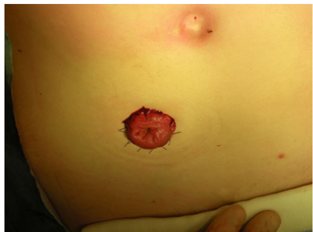
Fig. 2 Cosmetic result after single-port colectomy with an end ileostomy