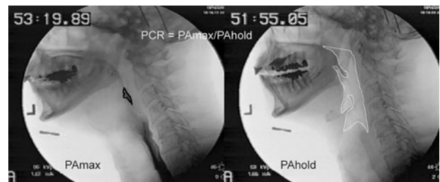
Fig. 1 PCR is calculated by dividing pharyngeal area at point of maximum constriction during a swallow by the area with a 1-cc bolus held in the oral cavity

Pharyngeal manometry and UES manometry were performed using a Koenigsberg 9-channel probe (Sandhill EFT catheter; Sandhill Scientific Inc., Highlands Ranch, CO). The 4.5-mm-diameter catheter has two circumferential solid-state pressure sensors at 5 and 10 cm from the tip and three unidirectional pressure sensors at 15, 20, and 25 cm. The catheter was inserted transnasally into the esophagus just below the UES. Baseline esophageal and pharyngeal pressures were then established. The UES pressure was determined by a 0.5-cm station pull-through