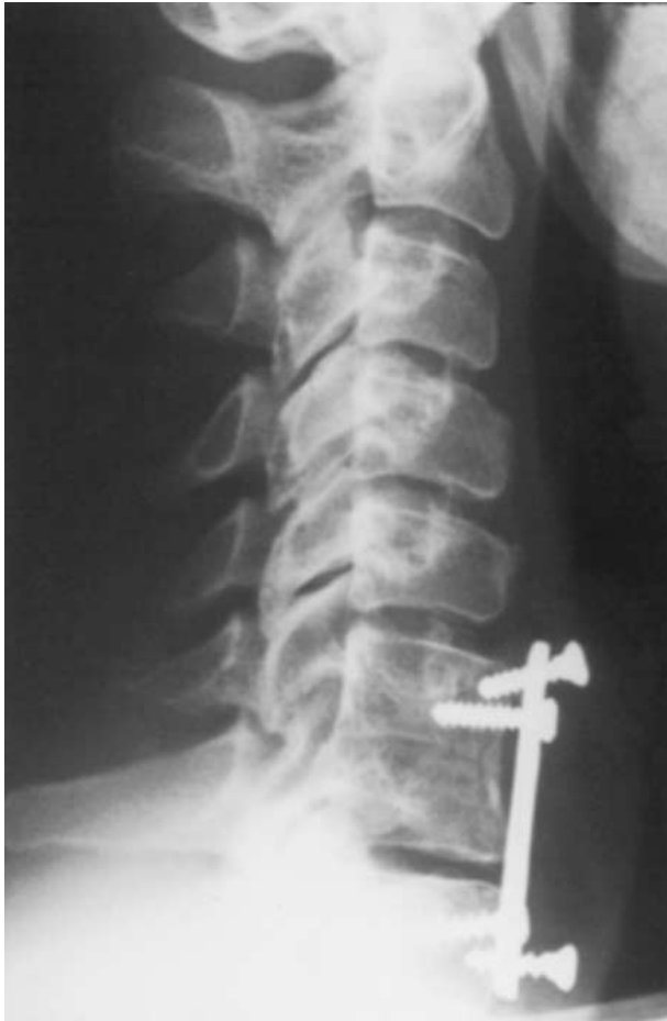
Fig. 2. Loose screws causing esophageal problems. Clearly visible, several screws of the spinal instrumentation are loose and protruding toward the esophagus. In this case there was not yet a laceration of the esophagus.

Totals add up to more than the actual number of patients because multiple inspections were possible.