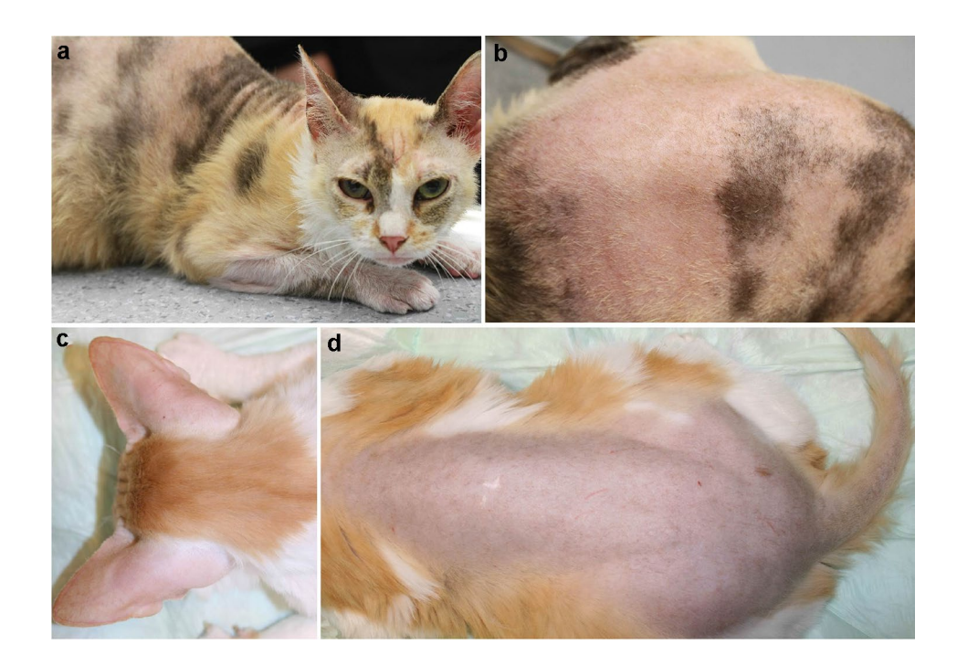
Fig. 1 Clinical phenotype of the affected cats with hypotrichosis and alopecia on the convex pinnae, parts of the face, the back, and the legs. a , b Case no. 1. c , d Case no. 2