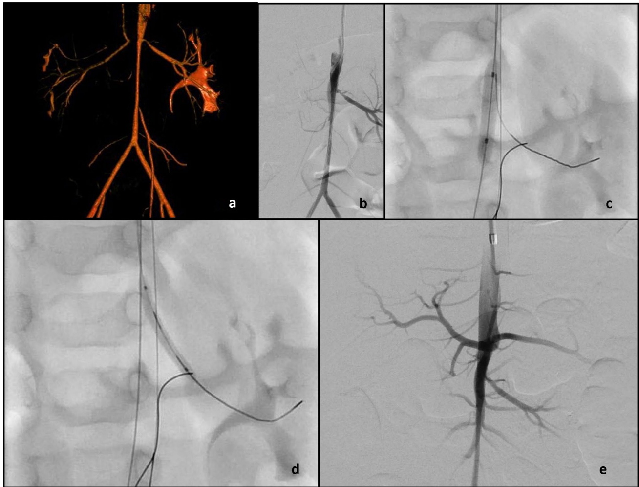
Fig. 3 An 11-month-old infant, who was admitted to their local hospital with upper respiratory tract symptoms at the age of 6 months, was found to be hypertensive with a systolic blood pressure of 200 mmHg. Rotational angiogram (a) and digital subtraction aortogram (b) demonstrate middle aortic stenosis, stenosis of the left renal artery ostium and complete occlusion of the right renal artery origin with filling of the distal right renal artery via collaterals.

Angioplasty of the juxtarenal abdominal aorta (c) with a 5 mm balloon, with safety wires in the left renal artery and superior mesenteric artery, was performed. Angioplasty of the left renal artery (d) with a 2.5 mm balloon was performed. Completion digital subtraction angiography (e) shows improved calibre of the juxtarenal abdominal aorta and left renal artery origin. Despite exhaustive efforts it was not possible to recanalize the occluded right renal artery (b, e)