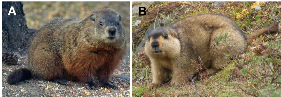
Fig. 1 Pictures of eastern woodchuck M. monax (a) and M. himalayana (b). Himalayan marmots are closely related to the woodchucks and can be infected with WHV. They are about the size of a large housecat and live in colonies

the control over HBV. High load of virus particles and large amounts of HBsAg in the liver and peripheral blood may be responsible for the immune tolerant status in the patients. Therefore, pretreatment with nucleos(t)ide analogues has been proposed to achieve better CD8 T cell response and subsequent therapeutic efficacy after administration of DNA vaccines.