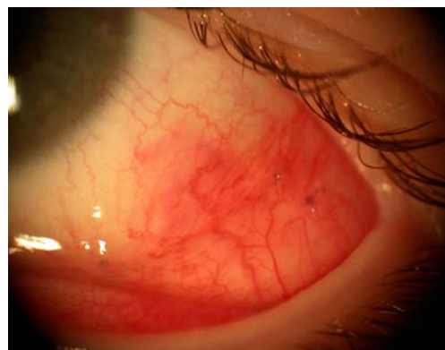
Fig. 2 Photographs of a 15-year-old girl with strabismus sursoadductorius 24 hours after a 13 mm recession of the left inferior obliquus muscle. The conjunctiva has been closed with two single sutures at the original insertion site and with one single suture where the muscle has been reattached to the sclera

In this study, a minimally invasive obliquus graded recession technique and their results have been presented. Recession is performed through two small radial cuts, one placed at the obliquus insertion site and one where the muscle is reinserted to the sclera (Fig. 1). The advantage of this new technique is a better visualization of the desinsertion of the muscle, since one opening is placed exactly where the muscle is detached. Additionally, anatomical disruption is minimized, since the conjunctiva is only opened at the desinsertion and reinsertion site. If the surgeon needs a better visibility of the operative site, the small cuts can be enlarged or even joined (Fig. 1j). In this patient series, there was need for that in one eye (5%). The whole surgical procedure can be performed with the same instruments used for standard, limbal approach apart from use of a blunt cannula. There is no need for an assistant. Despite a restricted conjunctival opening, the MISS technique made it possible to adequately perform surgery.