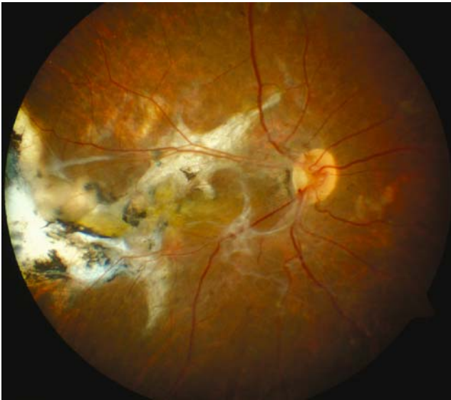
Fig. 2 Patient with light perception vision after treatment of endophthalmitis and removal of intraocular foreign body

vitroretinopathy in 5 eyes and corneal or macular scar in 5 eyes. Overall, 22 eyes (50%) that developed endophthalmitis due to trauma and retained IOFB had improvement in their VA. Ten eyes (22.7%) with endophthalmitis became NLP compared to 58 eyes (10.6%) from the larger group which became NLP but had no evidence of endophthalmitis, the difference being significant ( P < 0.05 ). Among the 10 eyes with endophthalmitis where the final vision of NLP was recorded after the treatment of IOFBs and associated endophthalmitis, only 2 eyes had anterior location of FBs compared to 8 eyes where FBs were found in the posterior chamber. Among the patients with endophthalmitis, 4 eyes (12.9%) from the vitrectomy group (31 eyes) had final vision of NLP, while from the eyes without vitrectomy (11 eyes), 5 eyes (45.4%) had final vision of NLP, the difference between these two groups being significant ( P < 0.05 ).