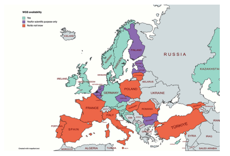
Fig. 3 Diagnostic availability based on survey responders. It was considered Yes or Yes/for Scientific purpose only if "Yes" or "Yes" plus "for scientific purpose only" were > 66.6% of total answers, otherwise, it was considered as no/do not know