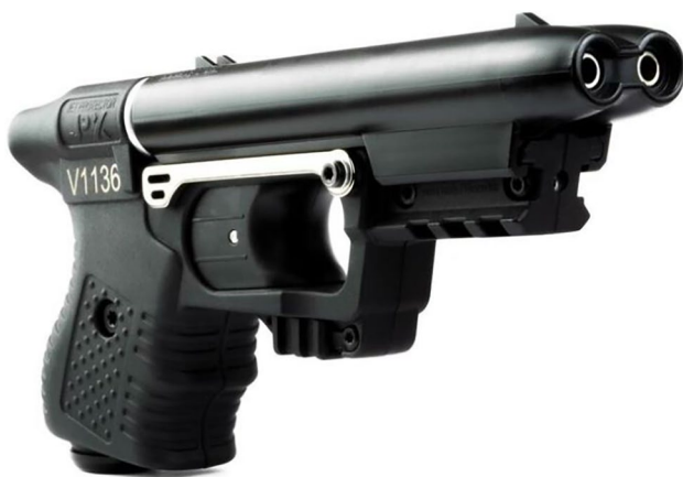
Fig. 1 The pepper spray launcher “Jet Protector JPX®” [13]

In the present case, a shooting distance of about 0.3 m is to be assumed. At this distance, a jet velocity of approx. 180 m/s [10, 11] can be expected, with the entire mass of the jet (approx. 9 g) hitting the target. This results in an impact energy of 146 J. With a jet opening angle of 3\text{--}4^\circ , a beam diameter of 30–40 mm will result at 0.3 m. This results in