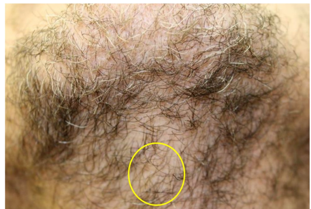
Fig. 3 Appearance of the scar about half a year after the incidence