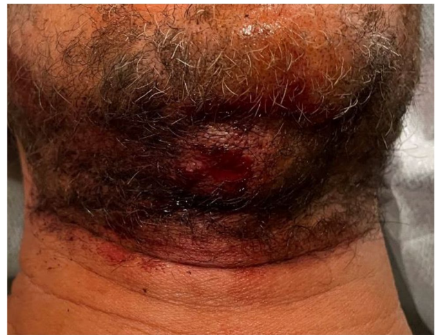
Fig. 2 Skin wound caused by the second pepper spray shot

Example: A hydraulic pipe under 10 bar pressure results in an outflow velocity of the fluid of approx. 50 m/s and an energy flux density of 0.05 \text{ J}/(\text{mm}^2 \cdot \text{ms}) . A 10 cm long jet