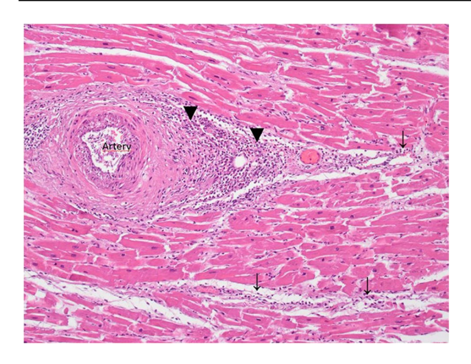
Fig. 1 Case 6 with myocarditis with lymphocytic and plasmocytic infiltration of the perivascular space (black down-pointing triangle) and the myocard (downward arrow) (H&E, Orig. Magn. 100×)