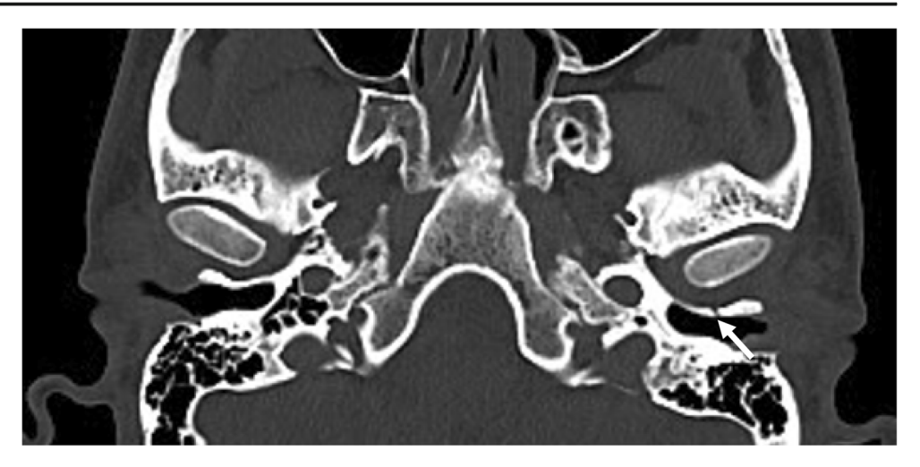
Fig. 2 Computed tomography showing isolated left tympanal bone fracture (arrow). The victim received multiple kicks in the head during an assault

tympanic membrane and middle ear, invade the petromastoid cells, or extend to other parts of the temporal bone [14]. In severe cases, surgical resection is mandatory. Furthermore, if left untreated, EAC stenosis can induce conductive hearing loss [11]. Therefore, TBF requires a proper diagnosis, medical survey, and occasionally an otologic treatment (packing and/ or stent of the EAC) in order to prevent complications [11, 12, 14].