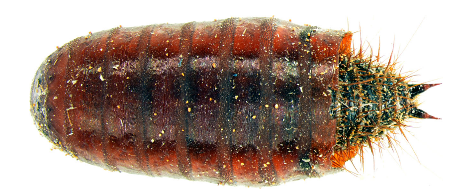
Fig. 2 Larva of Dermestes haemorrhoidalis in the interior cavity of puparium of Calliphora vicina (general view)

one had been living in the flat in question for at least a