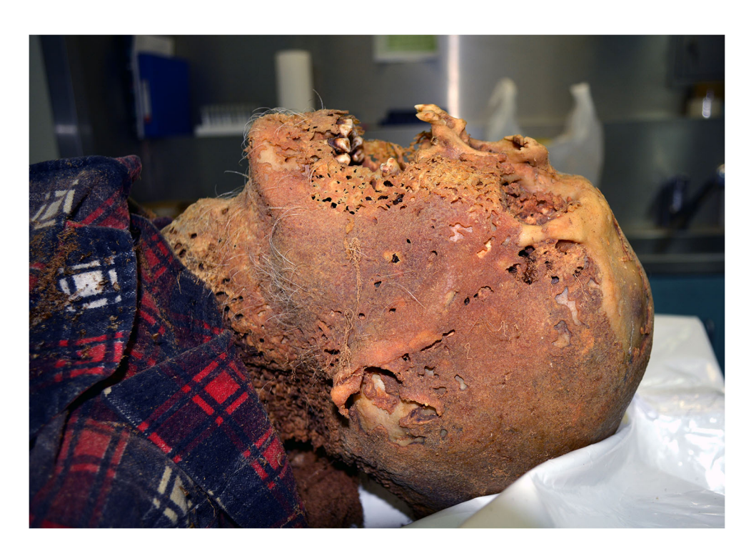
Fig. 4 The openings in the mummified skin of the head due to the feeding activity of Dermestidae (general view)

The remains had been significantly skeletalised and subjected to subsequent fixative changes, i.e. transformed posthumously and dried (mummified), with residually preserved and transformed soft tissues. Present on the remains was clothing,