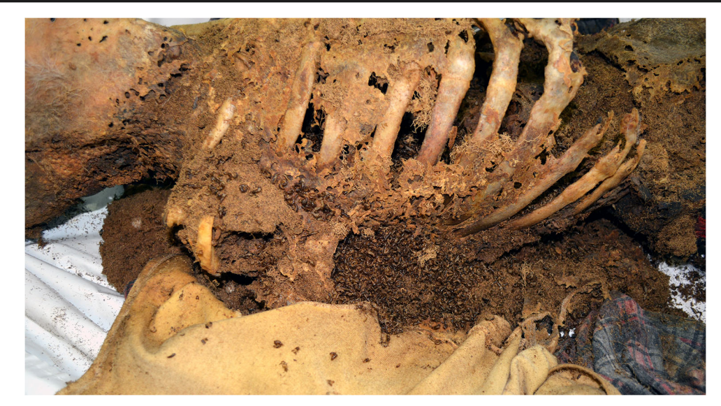
Fig. 5 The feeding activity of Dermestidae on the chest (general view)

which had dried out and adhered to skin integument. Fragments of advertising flyers from the Biedronka supermarket chain, dating from 2013, were dried and stuck to the clothing.